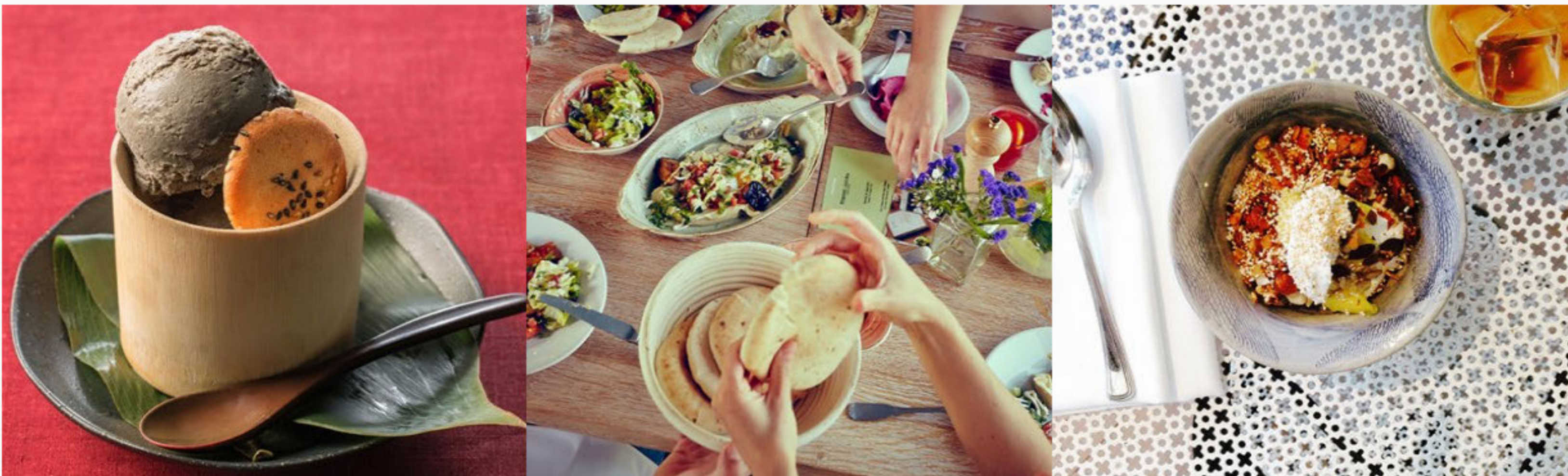
Dishes by (from left) Zenkichi Berlin // Neni Berlin // The Store Kitchen